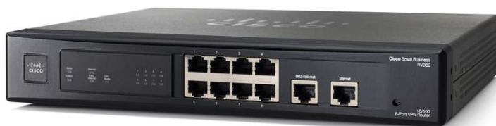
Figure 1. Cisco RV082 Dual WAN VPN Router

To further safeguard your network and data, the Cisco RV082 includes business-class security features and optional cloud-based web filtering. Configuration is a snap, using an intuitive, browser-based device manager and setup wizards.