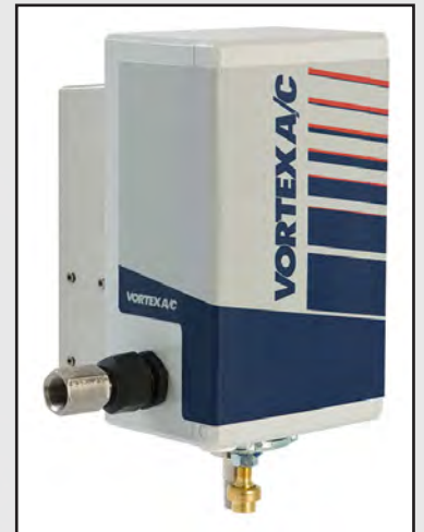
Vortex Cooler® ITW Air Management