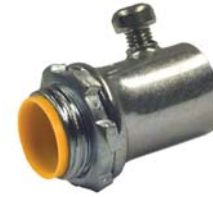
Insulated Connectors Steel