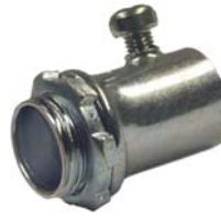
Uninsulated Throat Connectors Steel